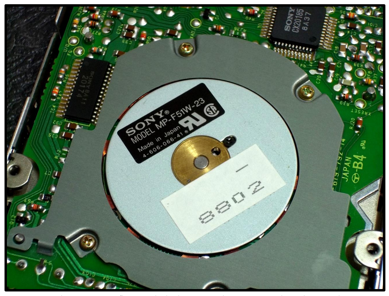
Figure 4. The Sony 3.5 floppy disk drive mechanism used in the Apple 1.44 Mb floppy disk drives.