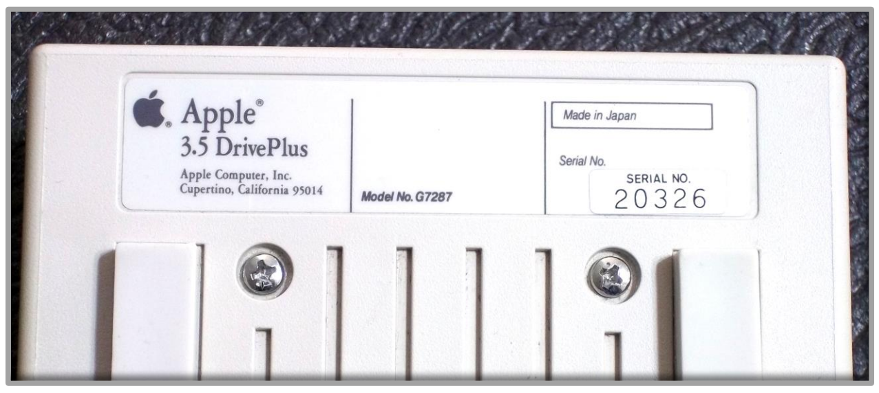
Figure 1. The Apple 3.5 DrivePlus, Model No. G7287.

Up until now it has been generally acknowledged that Apple's 1.44 Mb 3.5" drive was manufactured and marketed under two names, both bearing the G7287 model/family number – the Apple 3.5" FDHD drive and the Apple SuperDrive. But I have recently acquired another Apple 3.5" 1.44 Mb drive that is labelled with another name: the Apple 3.5 DrivePlus and also bears the model/family number G7287 (Figure 1).